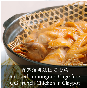
香茅烟熏法国安心鸡 Smoked Lemongrass Cage-free GG French Chicken in Claypot