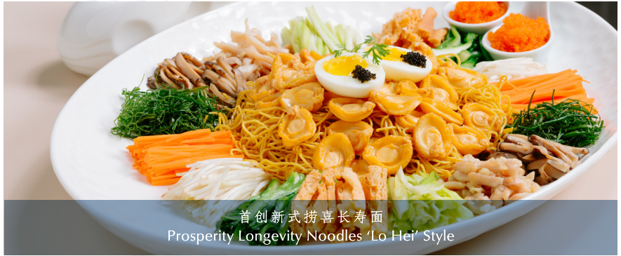
首创新式捞喜长寿面 Prosperity Longevity Noodles 'Lo Hei' Style