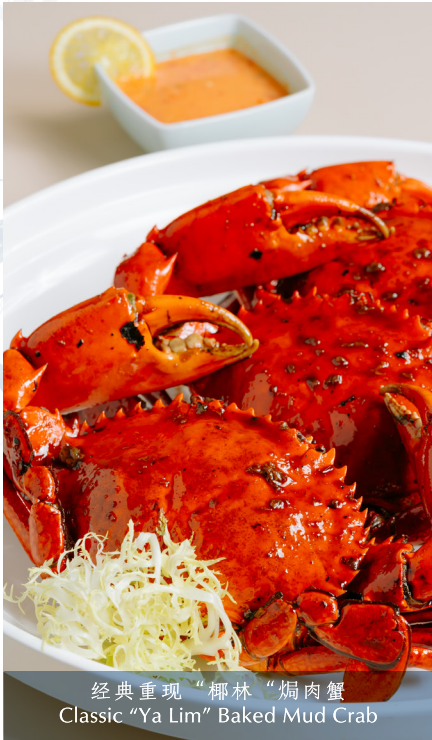
经典重现“椰林”焗肉蟹 Classic "Ya Lim" Baked Mud Crab